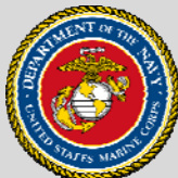
U.S. Marine Corps