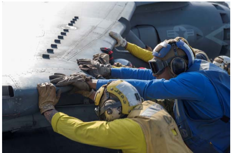
PACIFIC OCEAN - Sailors push an AV-8B Harrier, attached to Marine Attack Squadron 214 (VMA-214) "Blacksheep", to a stopping point on the flight deck of amphibious assault ship USS Bonhomme Richard (LHD 6). Bonhomme Richard is the lead ship of the Bonhomme Richard Amphibious Ready Group and is slated to participate in amphibious integration training (AIT) and a certification exercise (CERTEX) with the embarked 31st MEU.