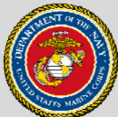
U.S. Marine Corps