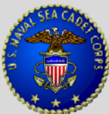
DESERT EAGLE SQUADRON ESCONDIDO BATTALION & TRAINING SHIP KIT CARSON US NAVAL SEA CADET CORPS